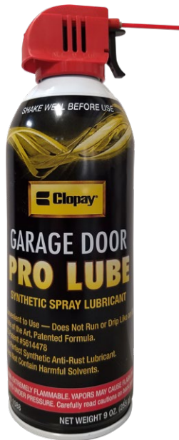
PRO LUBE Garage Door Spray Lubricant